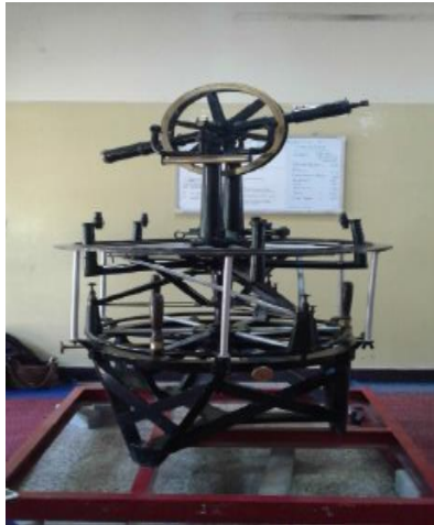
c. Survey of India, Government of India