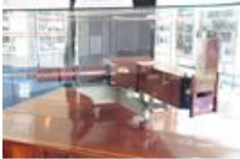
c. Indian association for the Cultivation of Science, Kolkata